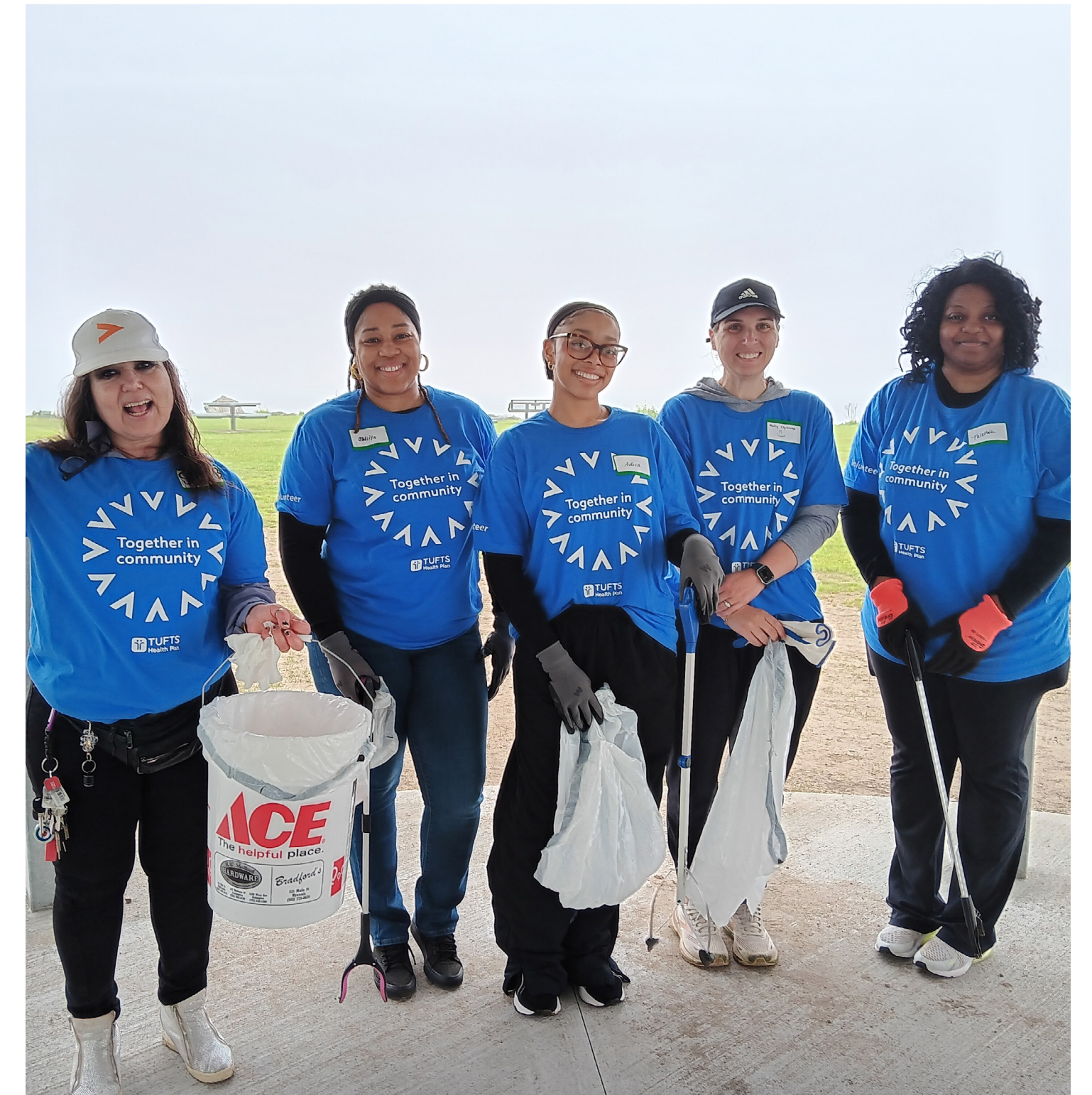
Point32Health volunteers supporting Save the Bay.