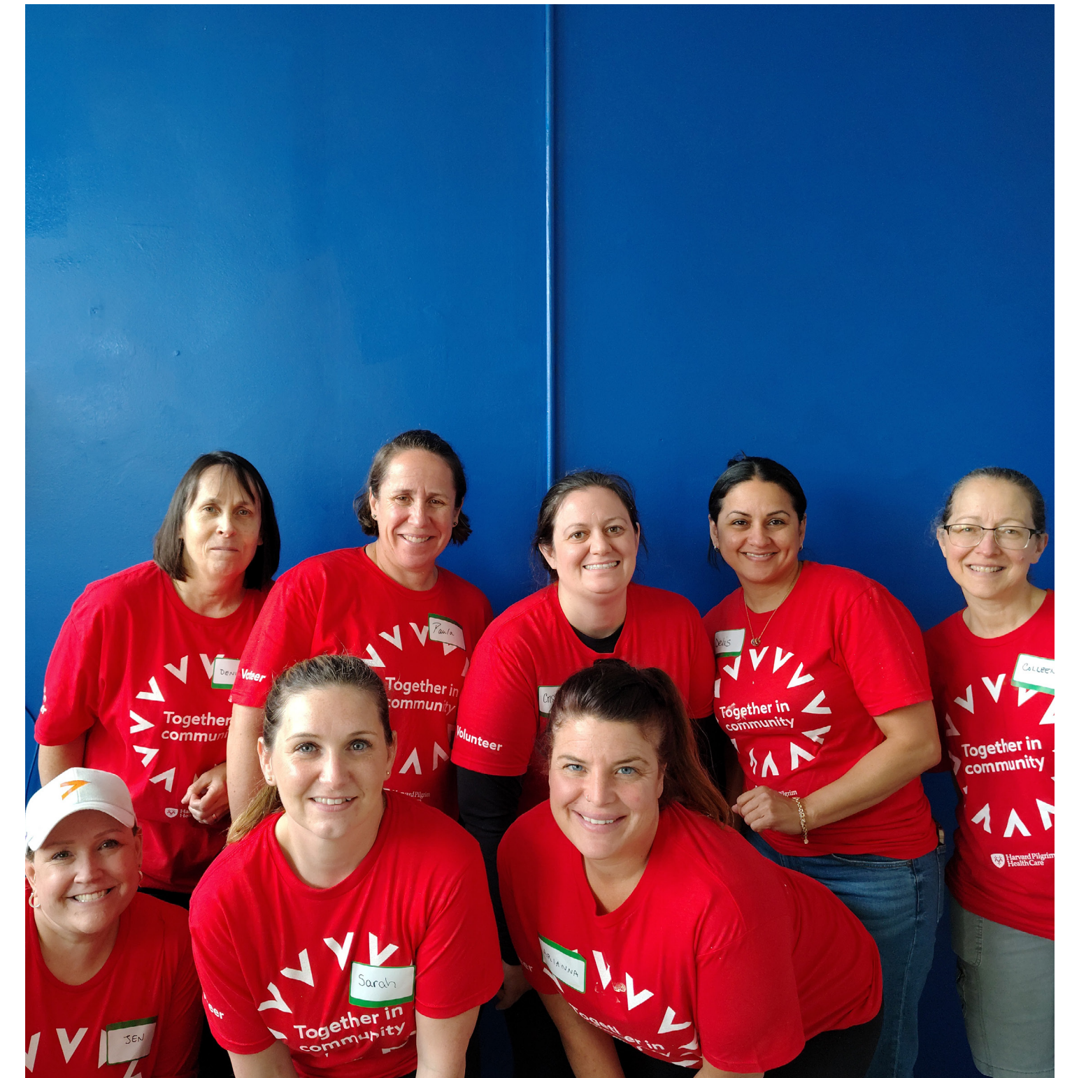
Point32Health volunteers supporting Families in Transition.