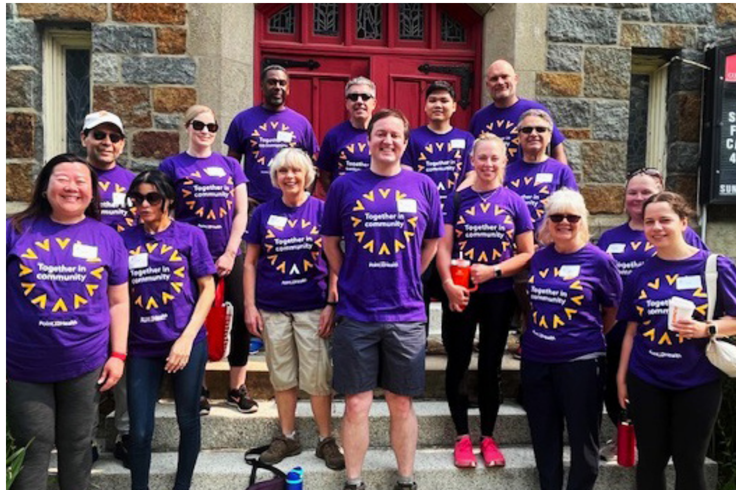
Point32Health volunteers at South Shore Stars.

Our Corporate Citizenship and community relations programs support nonprofit organizations addressing the social and economic factors impacting everyone's health and well-being. Examples: