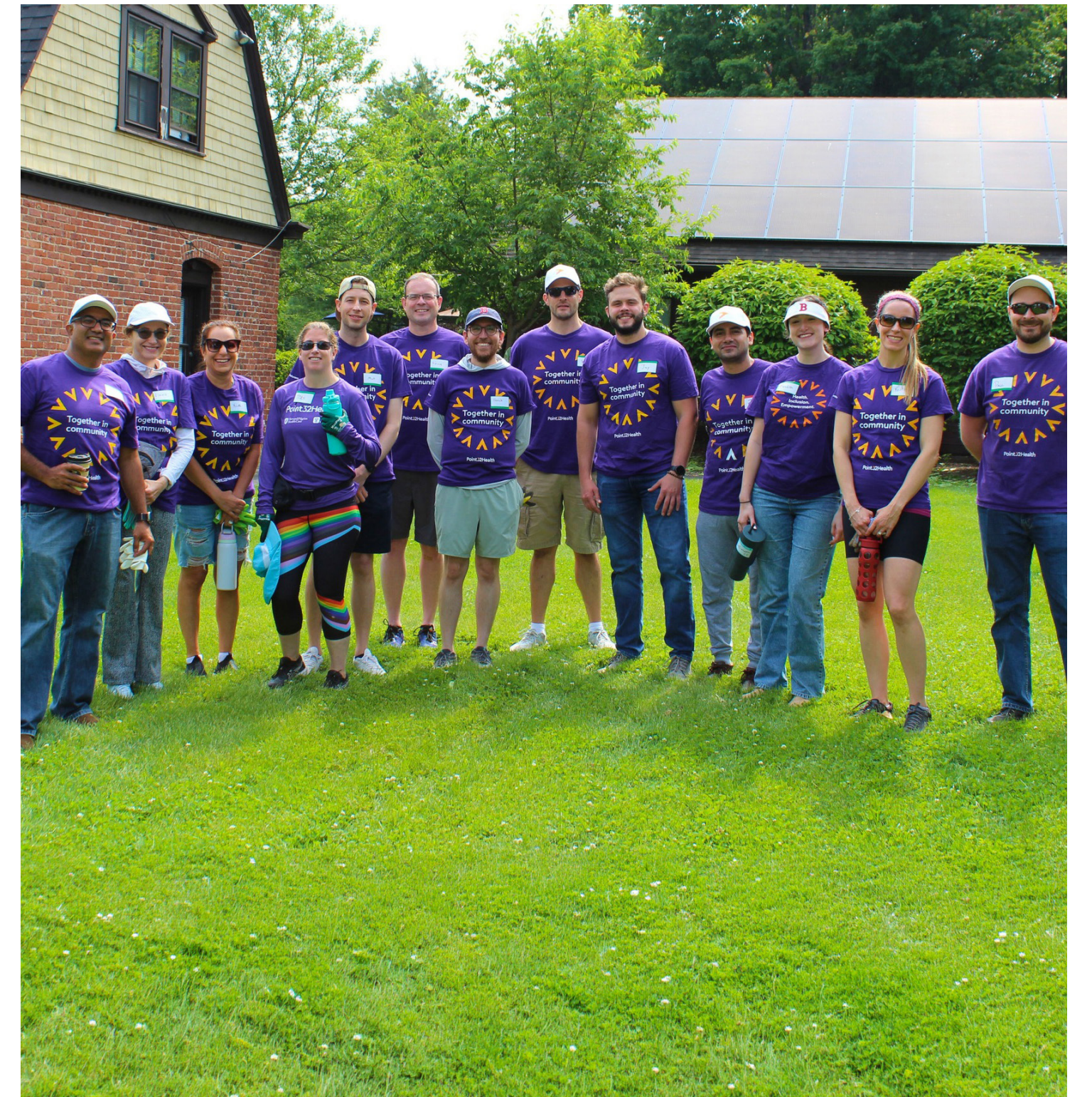
Point32Health volunteers supporting The Carroll Center for the Blind.