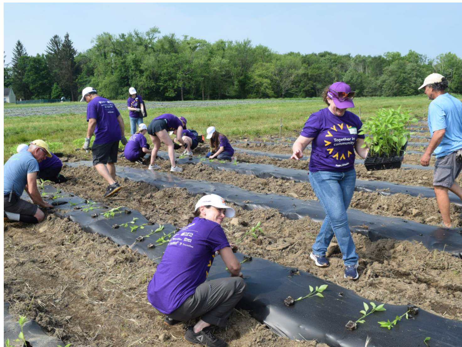
Point32Health volunteers at Community Harvest Project.

$1.3M to 500+ Massachusetts nonprofit organizations through employee giving programs