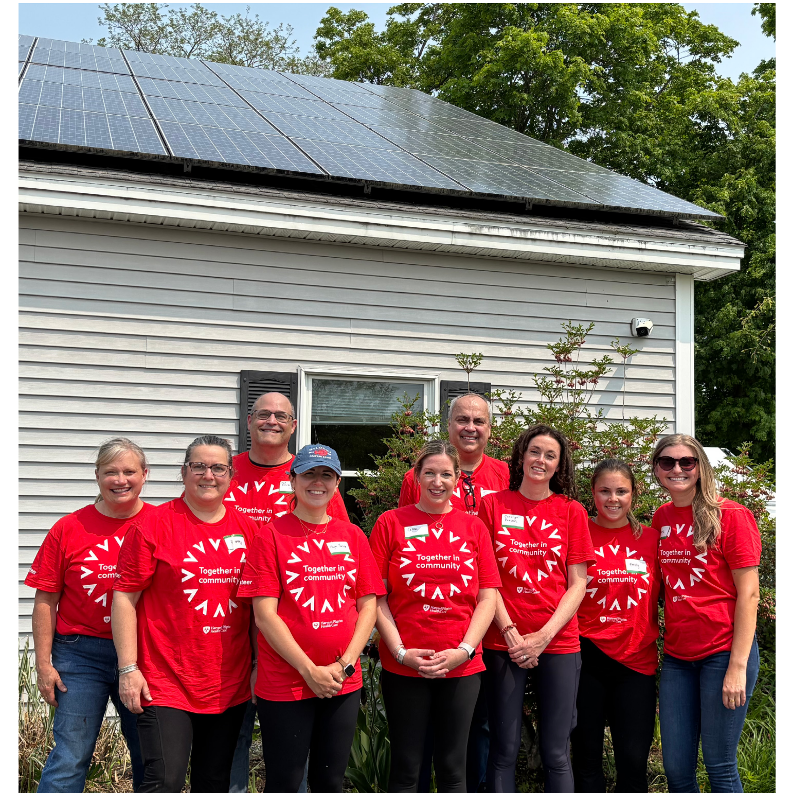
Point32Health volunteers supporting Mid Coast Hunger Prevention Program.