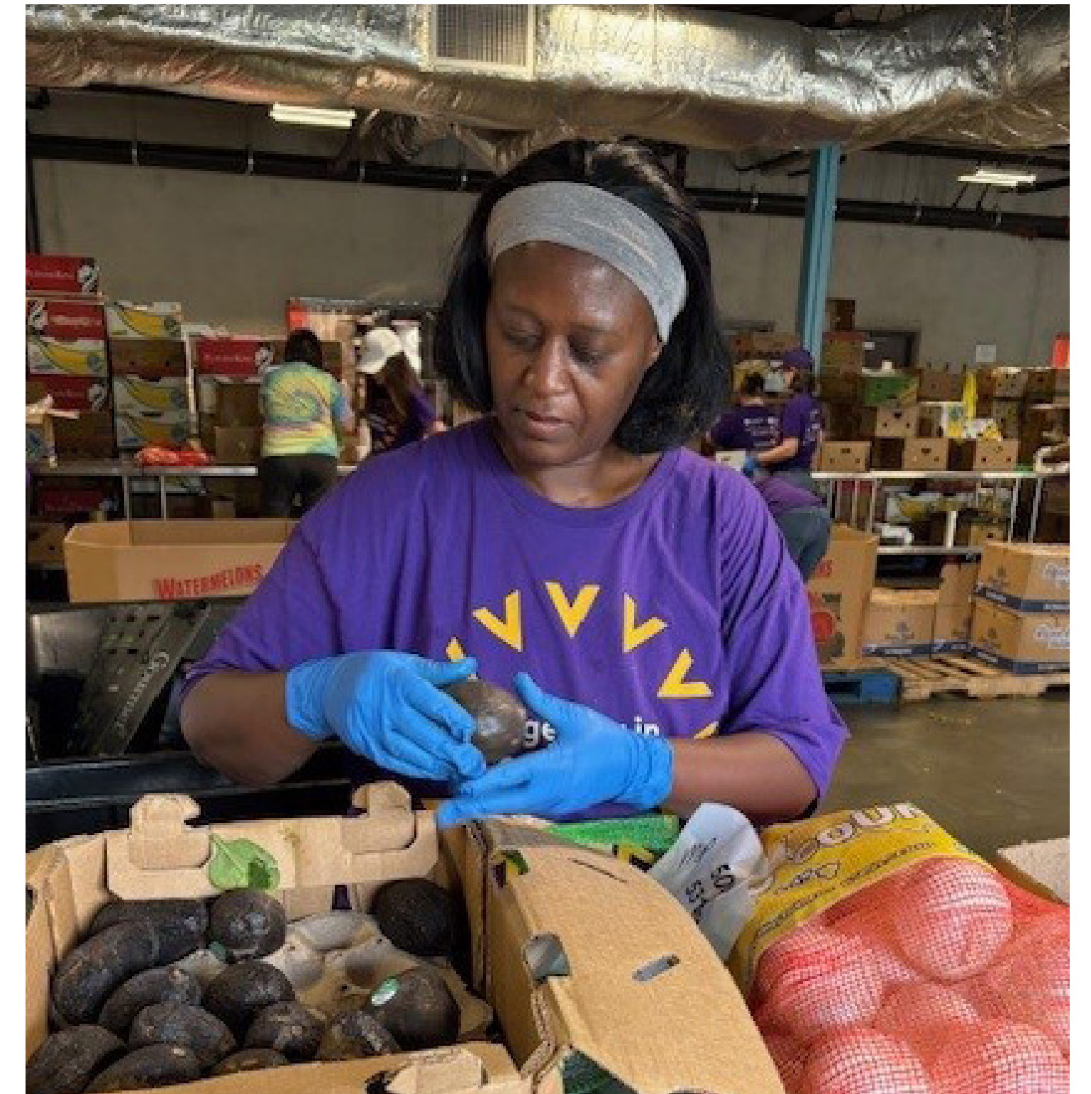
Point32Health volunteer at Connecticut Foodshare.