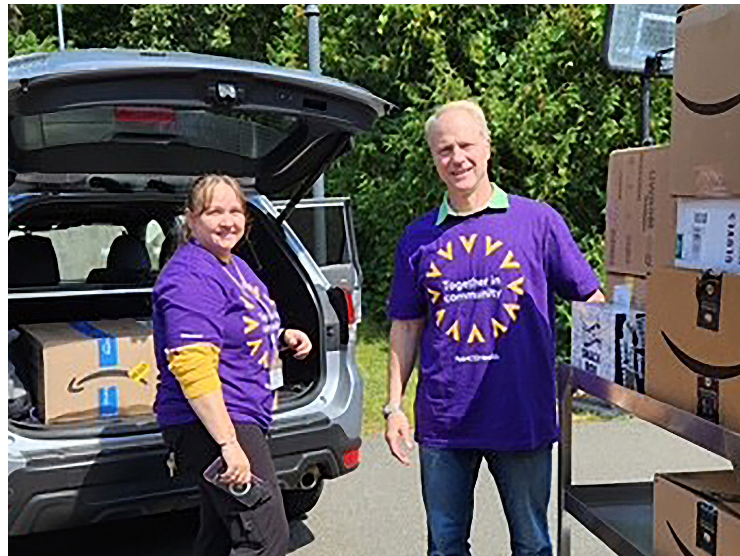
Point32Health volunteers supporting H.O.P.E. Partners of Farmington.

Employee support for Connecticut nonprofits also includes: