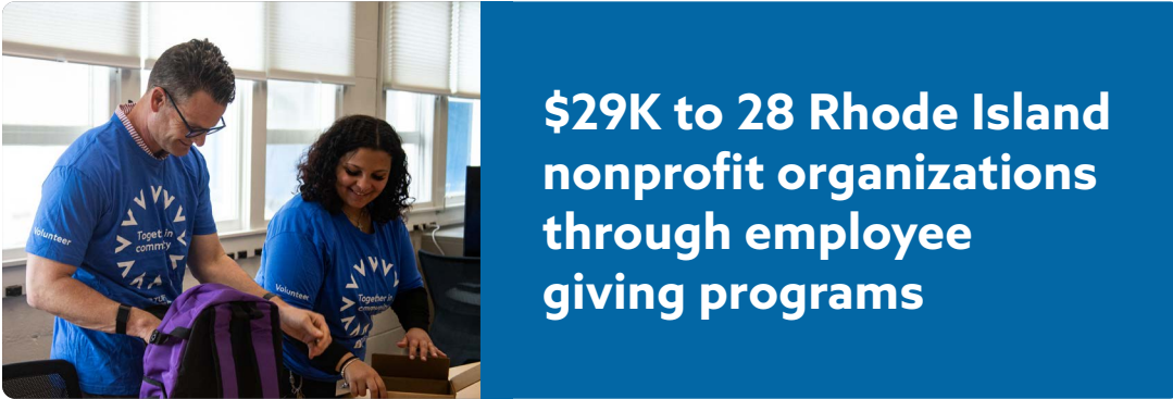
Point32Health volunteers supporting Meals on Wheels of Rhode Island.

Employee support for Rhode Island nonprofit organizations also includes: