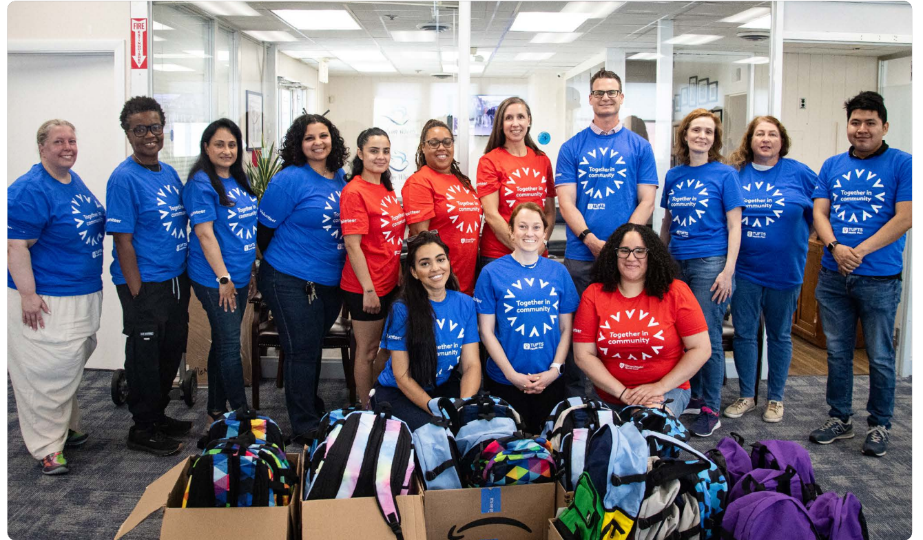
Point32Health volunteers supporting Meals on Wheels of Rhode Island