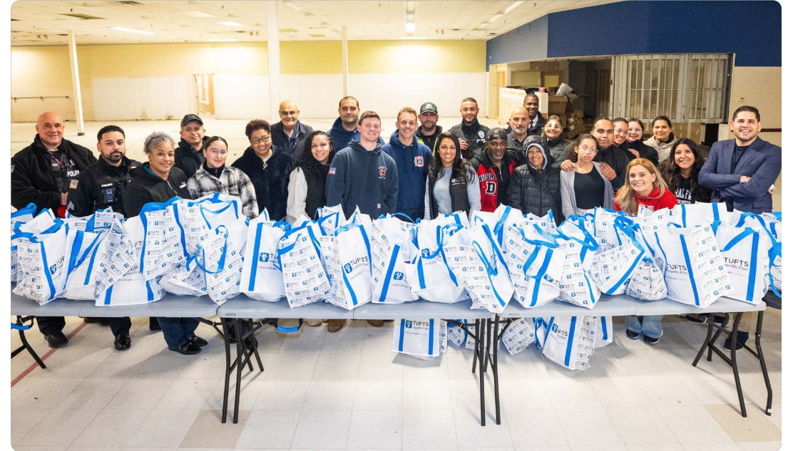
Point32Health volunteers supporting Central Falls Thanksgiving drive.