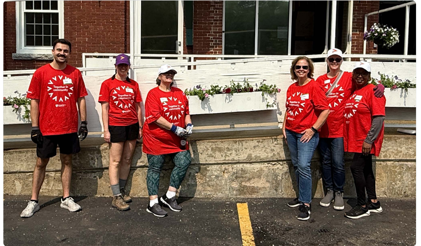
Point32Health volunteers supporting Girls at Work