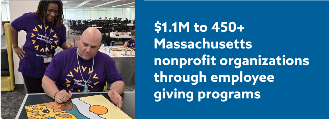
Point32Health volunteers supporting Foundation for Hospital Art

Our Corporate Citizenship and community relations programs support nonprofit organizations addressing the social and economic factors impacting everyone's health and well-being, including: