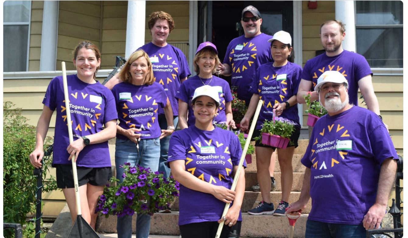
Point32Health volunteers supporting Friendly House