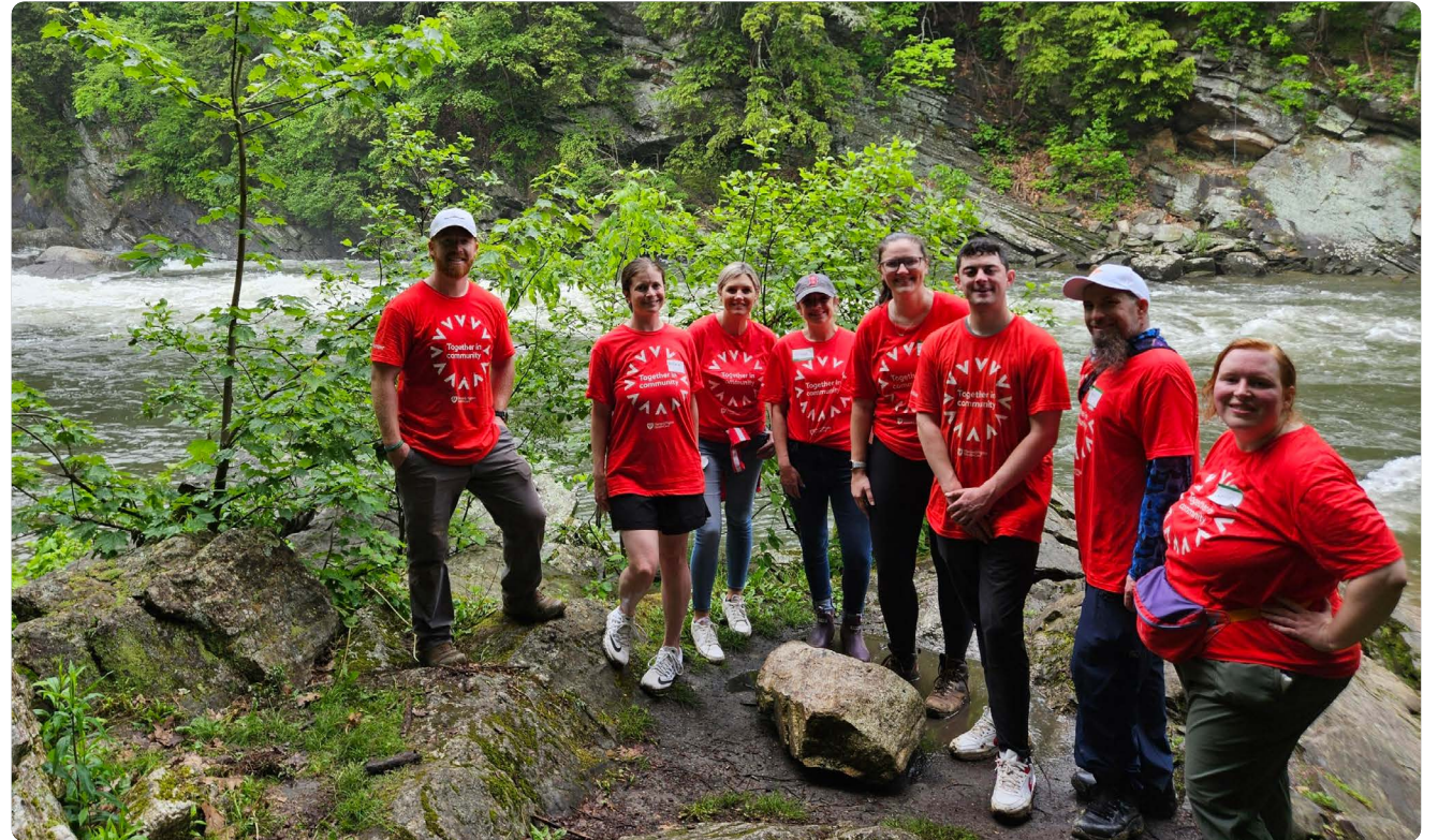
Point32Health volunteers supporting Portland Trails