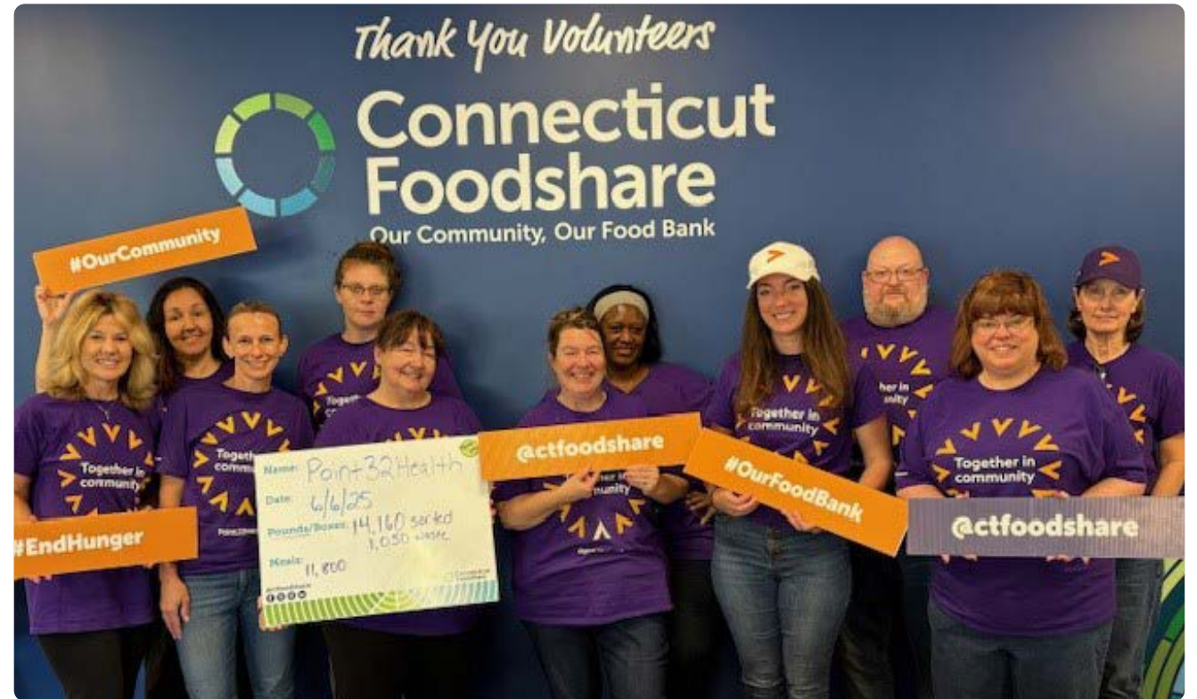
Point32Health volunteers supporting Connecticut Foodshare