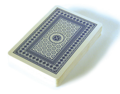
One portion of meat (3 oz.) = deck of cards